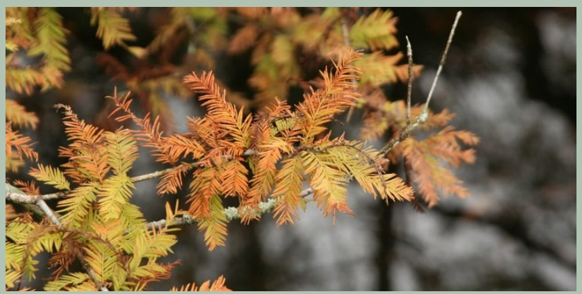
Bald Cypress Fall Colors

Sources: Morton Arboretum, University of Florida