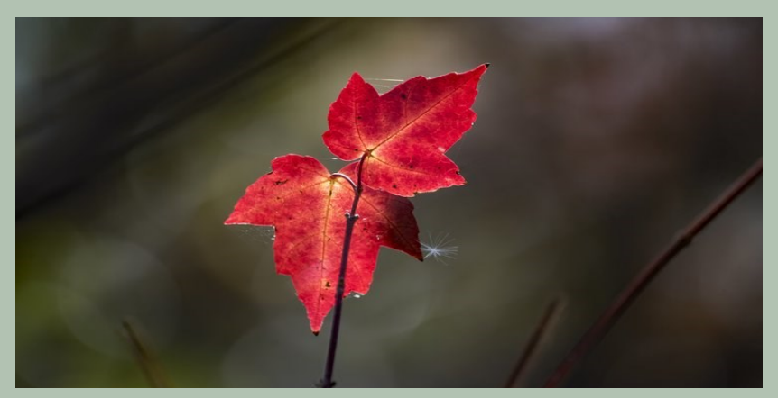
Red Maple Leaf

Did you know that red maple trees actually prefer wetlands? One of their nicknames is "swamp maple".